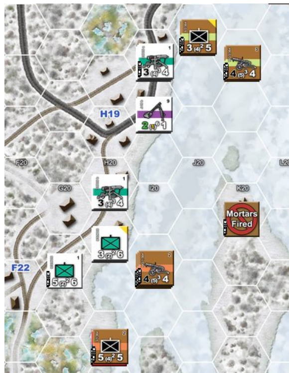
The screenshot is after turn 1.

The Finns then made their counterattacks in south and against one AT-gun in hex I19. The Finns were also supposed to attack in the northern end of town too but they never got their commands. I sent the game file to Mark for resolving possible Soviet ranged support and the actual combats after that and then to continue straight ahead with the next Soviet turn. In the heat of the battle Mark missed my mention of that northern attack at the end of one long sentence I used in my log file and the combat wasn't resolved at all. Well that's one of the dangers when playing by e-mail and trying to keep the number of game files to something reasonable. Finns managed to eliminate that AT-gun on ice easily and the southern attack forced one Soviet unit to retreat further away from town borders. Destroying the AT-gun didn't count against the three eliminated Soviet units for automatic victory but was necessary to free ranged support from adjacent units.