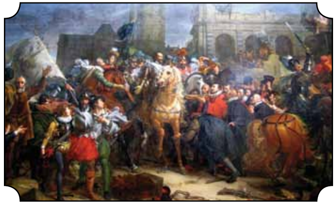
Navarre Enters Paris

Several great paintings are created at this time, though the most notable were expressionist works that did not gain renown until later centuries. El Greco finishes his masterpiece the Burial of the Count of Orgaz depicting a popular local legend. Meanwhile, Rudolf II's stable of artists in Prague is similarly busy. Giuseppe Arcimboldo completes a painting of the emperor as Vertumnus , god of the changing seasons, depicting Rudolf as a collage of fruits and vegetables!