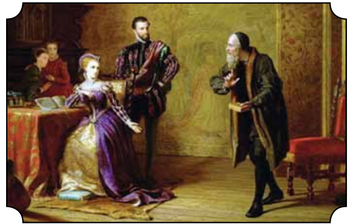
Mary Queen of Scots & John Knox

The Wars of Religion are about to begin!