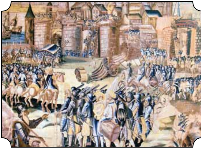
The Siege of La Rochelle