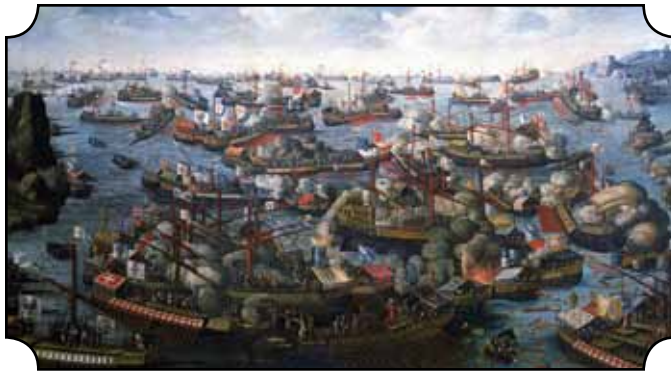
The Battle of Lepanto