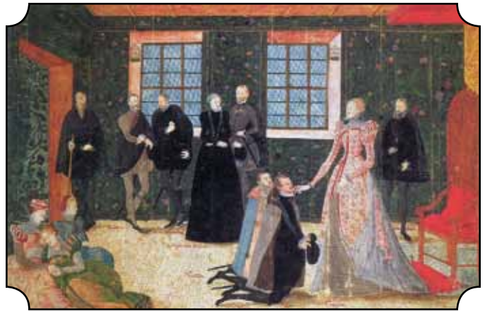
Elizabeth Receiving Dutch Ambassadors

JEANNE OF NAVARRE, SIR EDWARD STAFFORD, CATHERINE'S FLYING SQUADRON: Cancel an event named on this Response card just after the email that notifies you of its play. You are not permitted to wait until you have seen the full event execution and then play this response.