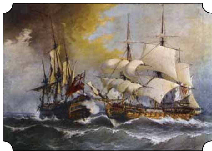
Race-built Galleon vs. Spanish Galleon