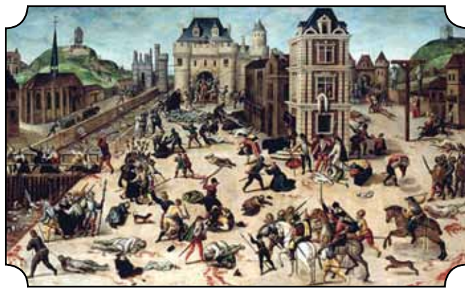
St. Bartholomew's Day Massacre