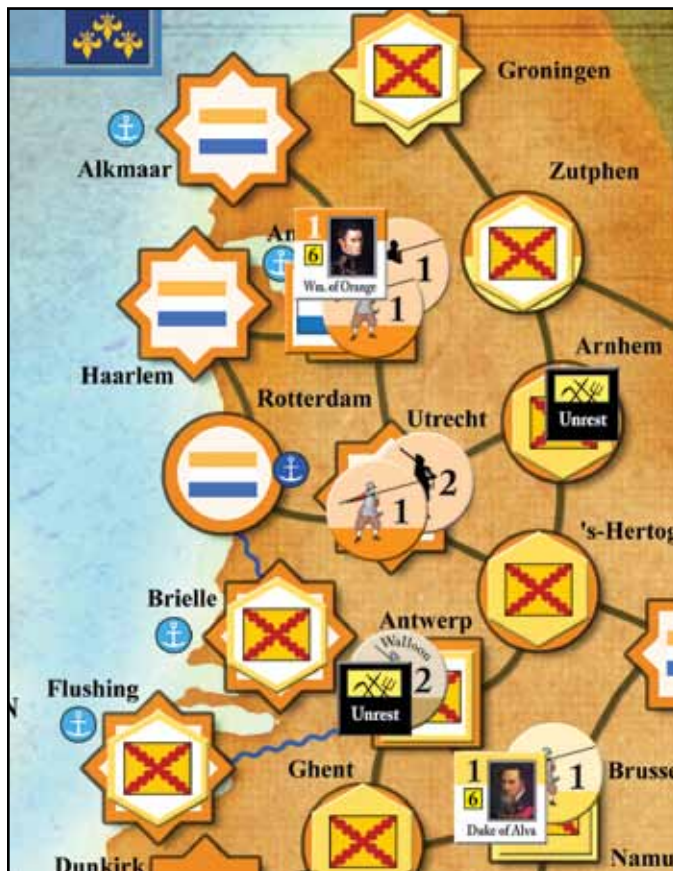
After the Protestant impulse

The Ottoman is now up in the fourth round of the Action Phase [They will now play the Dutch Revolt Mandatory Event since the Protestant is down to just one card and it looks like they've hit their high tide mark for the turn. Spain will gain 2 Dutch Revolt Bonus VP, but at least it is not the 3 VP it would have been if that event occurred at the start of the turn.] The players will continue playing cards in this fashion until all six powers have passed in consecutive impulses. Then they proceed to Phases 5, 6, 7 and 8 (Winter Phase, Marriage Resolution Phase, Patronage Phase, and Victory Determination Phase) to complete a turn of play.