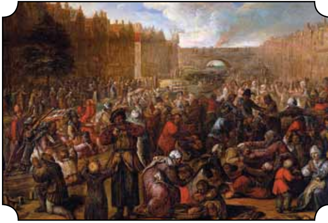
The Dutch Revolt Starts