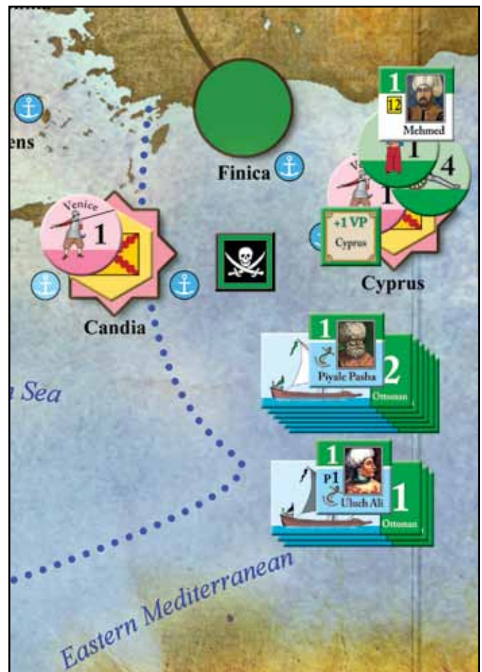
After the Ottoman impulse

CP4-5: Naval transport of Sokollu Mehmed and 5 regulars to Cyprus to establish a siege there.