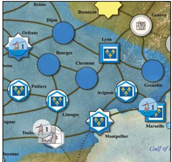
After France's impulse

CP3: Add 1 Diplomatic Influence to Venice (now at 1). France is still planning to play SULTANA SAFIYE before the turn is over, so this influence will help when that diplomatic status check is made.