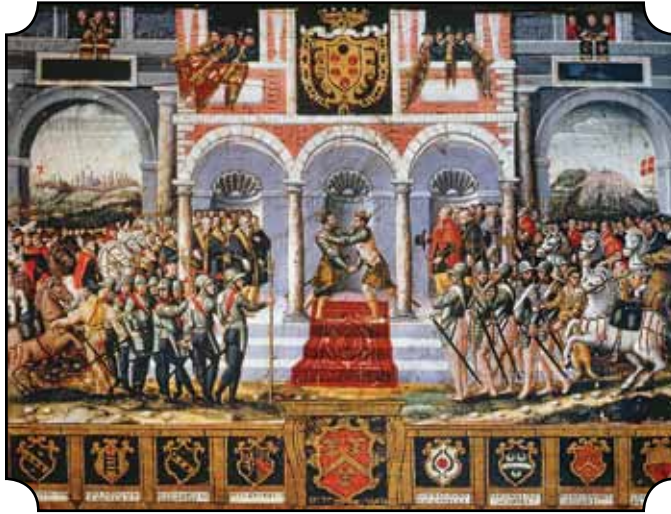
The Treaty of Cateau-Cambrésis

This section outlines the history of the Wars of Religion, organized into the seven turns represented in the game. People, events and artwork listed in bold are represented directly in the game with a counter or event.