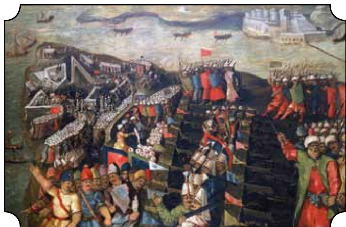
The Siege of Malta